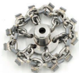
WC 1000 SERIES for 8mm cable