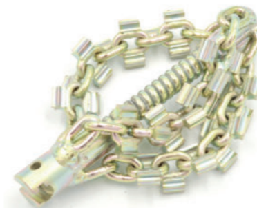
RS-T-WS SERIES T-slide connectors