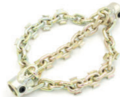
RS 3000 SERIES for 12mm cable