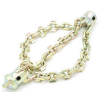
RS-DR 3000 SERIES for 12mm cable