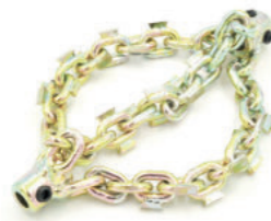
RS 1000 SERIES for 8mm cable