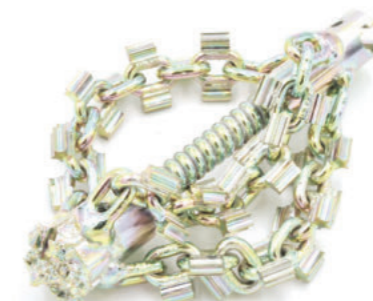
RS-T-WS-DR SERIES T-slide connectors, drill head