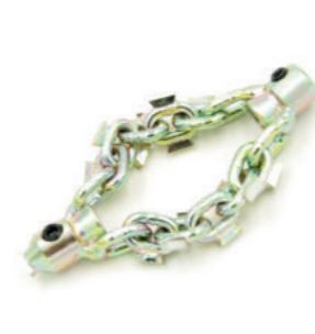
RS-DR 0000 SERIES for 6mm cable