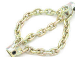
RS-NC 3000 SERIES for 12mm cable