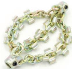
RS-WS 2000 SERIES for 10mm cable