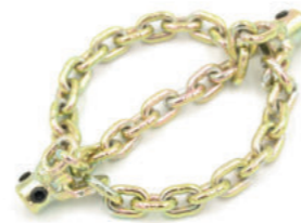
RS-NC 0000 SERIES for 6mm cable