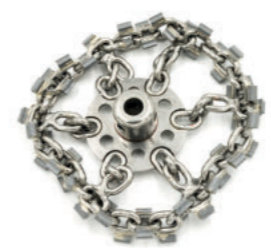
WC 2000 SERIES for 10mm cable