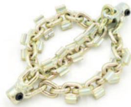
RS-WS 0000 SERIES for 6mm cable