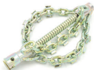
RS-T 16 SERIES T-slide connectors