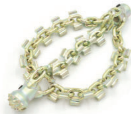
RS-WS-DR 2000 SERIES for 10mm cable