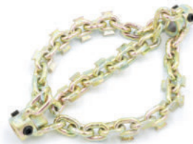
RS 0000 SERIES for 6mm cable

Chain Knocker is a mechanically rotated tool for sewer cleaning and pipeline renovations. NOT TO BE USED WITH HYDRAULIC ROTATOR.