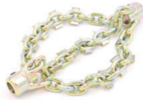
RS 2000 SERIES for 10mm cable