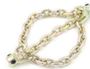
RS-NC 1000 SERIES for 8mm cable