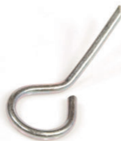
T-SLIDE KEY to open T-slide connection