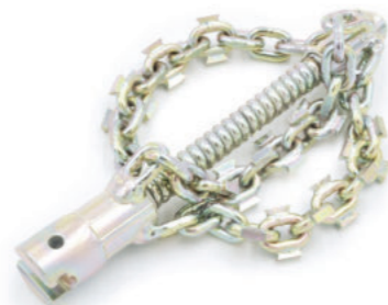
RS-T 20 SERIES T-slide connectors