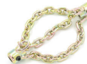
RS-NC 2000 SERIES for 10mm cable