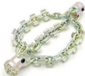
RS-WS-DR 3000 SERIES for 12mm cable