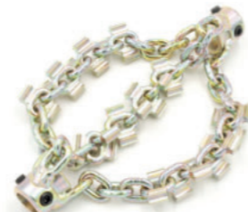
RS-WS 3000 SERIES for 12mm cable