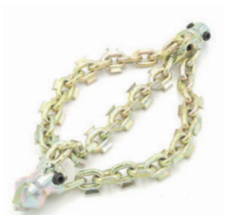
RS-DR 2000 SERIES for 10mm cable