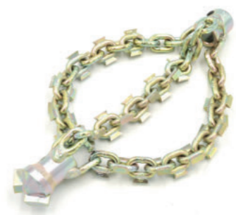
RS-DR 1000 SERIES for 8mm cable