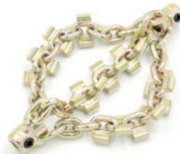
RS-WS 1000 SERIES for 8mm cable