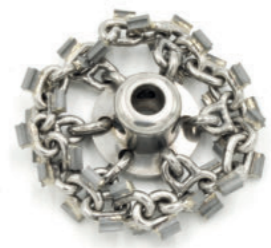
WC 3000 SERIES for 12mm cable