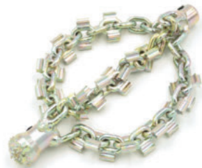
RS-WS-DR 1000 SERIES for 8mm cable