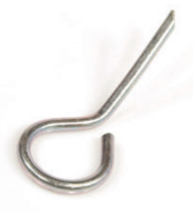
T-SLIDE KEY to open T-slide connection